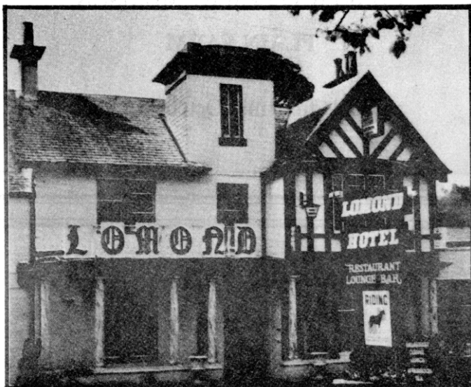
Lomond Hotel Glenfarg

BAR MEALS, HIGHTEAS, DINNERS FUNCTIONS CATERED FOR ACCOMMODATION AVAILABLE FREE HOUSE Tel. 474